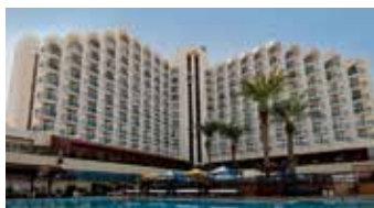
Leonardo Club Hotel Tiberias | ★★★★★☆

A charming hotel offering comfortable accommodations in the heart of Jordan. Known for its welcoming atmosphere, Wadi El Raha provides a relaxing retreat with modern amenities and easy access to nearby historic sites, making it an ideal choice for travelers exploring the region.