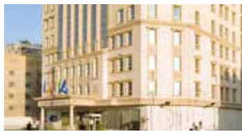
Barceló Cairo Pyramids | ★★★★★☆

This hotel is only 5 minutes from the Great Pyramids of Giza and a short distance from the center of Cairo providing contemporary rooms and accommodations. The rooms are fully air-conditioned and feature modern art prints. The stylish bathrooms include a shower and modern amenities.