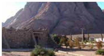
Wadi El Raha | ★★★★★

A contemporary hotel located just steps from the Mediterranean coast, offering stylish rooms with sea views. With excellent amenities including a rooftop pool, restaurant, and easy access to Tel Aviv's vibrant city life, the Grand Beach Tel Aviv provides a perfect base for both relaxation and exploration.