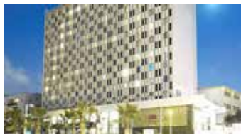
Grand Beach Tel Aviv Hotel | ★★★★★☆

This hotel is only 5 minutes from the Great Pyramids of Giza and a short distance from the center of Cairo providing contemporary rooms and accommodations. The rooms are fully air-conditioned and feature modern art prints. The stylish bathrooms include a shower and modern amenities.