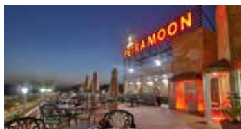
Petra Moon Hotel | ★★★★★

An all-inclusive resort located on the shores of the Sea of Galilee, offering comfortable accommodations and a range of family-friendly amenities. With a variety of dining options, a relaxing pool, and stunning views, the Leonardo Club Hotel Tiberias is a perfect destination for a peaceful and enjoyable stay.