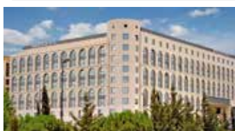
Grand Court Hotel Jerusalem | ★★★★★

A sophisticated 5-star hotel offering elegant accommodations in the heart of Amman. With luxurious amenities, exceptional dining options, and proximity to key cultural sites, the Grand Palace Amman provides a perfect blend of comfort and convenience for discerning travelers.