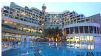
Enjoy Dead Sea Hotel | ★★★★★

A welcoming 4-star hotel located just a short walk from the entrance to Petra's ancient ruins. Offering modern rooms, a rooftop terrace with stunning views, and exceptional service, Petra Moon Hotel provides a comfortable and convenient stay for travelers exploring the Rose City.