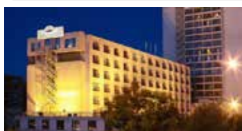
Grand Palace Amman | ★★★★★

A serene and rejuvenating resort located by the shores of the Dead Sea, offering comfortable accommodations and exclusive spa services. Guests can unwind in mineral-rich waters, indulge in wellness treatments, and enjoy stunning views, making it an ideal destination for relaxation and healing.